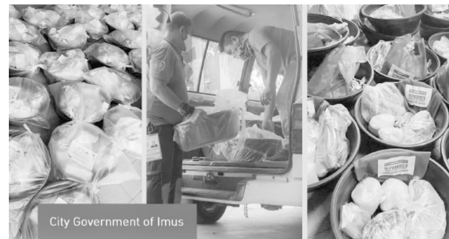
City Government of Imus